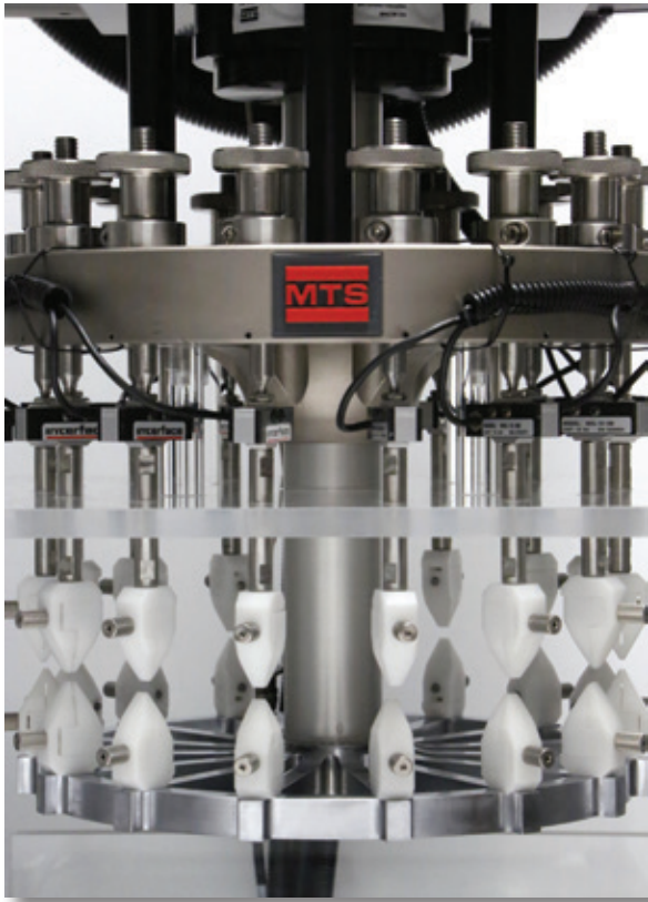
MTS MSF15 Fixture with Low Mass Grips