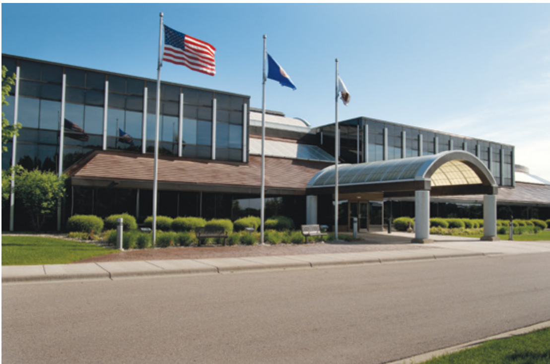
MTS Systems Corporation

The servohydraulic load frames that form the core of the 815 and 816 systems are the result of a world-class industrial design program. No matter which system fits your needs best, you can expect to perform rock mechanics tests safely and efficiently in a tightly controlled environment that emphasizes precision as well as easy operation.