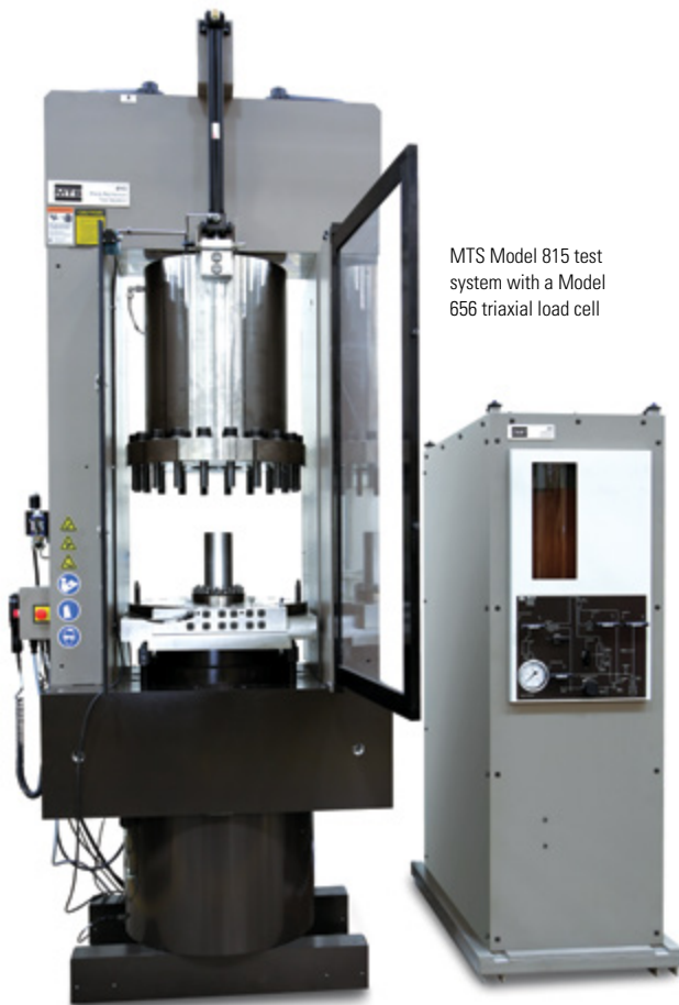
MTS Model 815 test system with a Model 656 triaxial load cell

The MTS Model 815 and 816 test systems include a number of features that help test professionals perform a wider variety of tests with a single system. Spacer plates allow you to choose from a range of specimen sizes. Load frames are pre-engineered for installation of triaxial cells. Other accessories are designed for easy installation in multiple configurations, depending on your needs. Plus, MTS can customize either system to accommodate unique requirements.