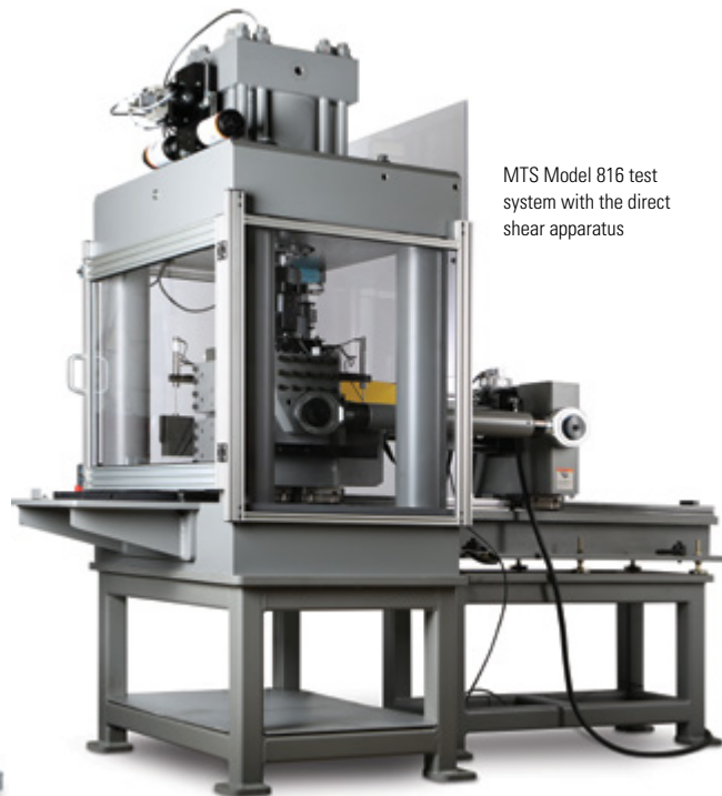
MTS Model 816 test system with the direct shear apparatus